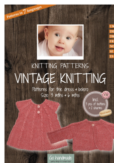
DRESS & BOLERO - VINTAGE 20032