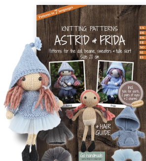
ASTRID & FRIDA 20026