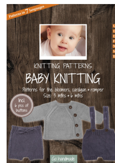
BLOOMERS, CARDIGAN & ROMPER - TENCEL/BAMBOO 20051