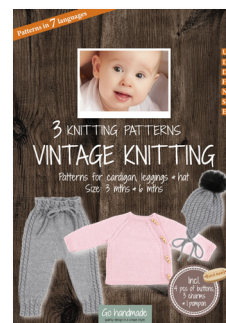
CARDIGAN, LEGGINGS & HAT - VINTAGE 20030