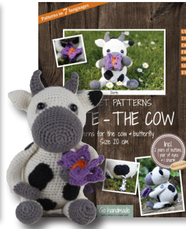
DORTE THE COW 20007