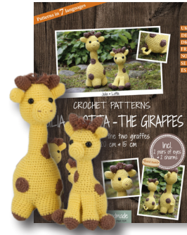
JULIA & LOTTA THE GIRAFFES 20008