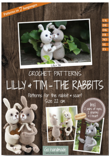
LILLY & TIM THE RABBITS 20002