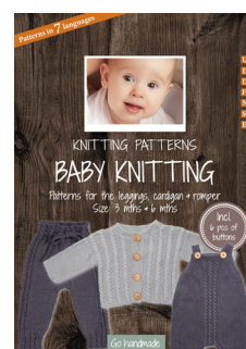
LEGGINGS, CARDIGAN & ROMPER - TENCEL/BAMBOO 20053