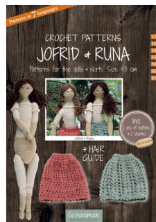
JOFRID & RUNA 20027