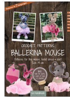
BALLERINA MOUSE 20003

"Once again gorgeous gorgeous gorgeous what else can I say