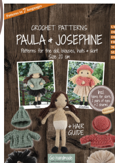
PAULA & JOSEPHINE 20009