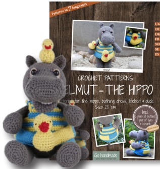
HELMUT THE HIPPO 20004