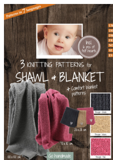
SHAWL, BLANKET & COMFORT BLANKET - SOFT 20034