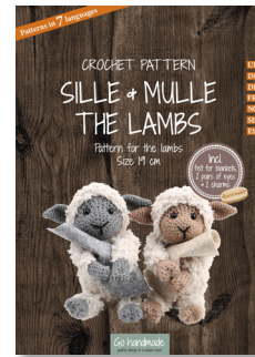
SILLE & MULLE THE LAMBS 20001