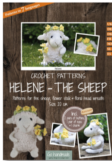
HELENE THE SHEEP 20006