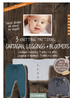
CARDIGAN, LEGGINGS & BLOOMERS - SOFT 20019