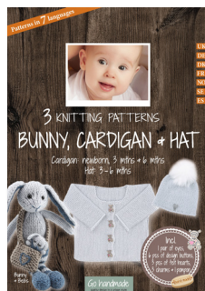
BUNNY, CARDIGAN & HAT - SOFT 20029