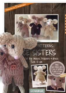
MICE SISTERS 20045

All babies should have a teddy as best friend