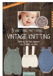
ROMPERS X 3 - VINTAGE 20046