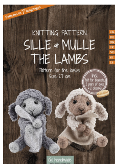
SILLE & MULLE THE LAMBS 20012