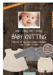
DRESS, BOLERO & BLOOMERS - TENCEL/BAMBOO 20049

*All yarn is available in multiple colours