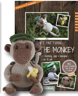
JIMMI THE MONKEY 20005