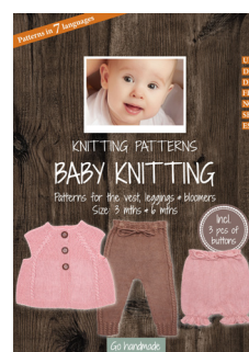
VEST, LEGGINGS & BLOOMERS - TENCEL/BAMBOO 20052