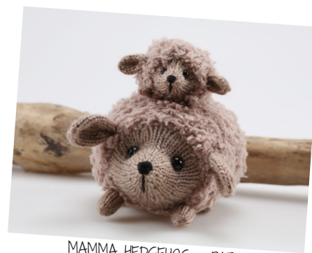
MAMMA HEDGEHOG & BABY