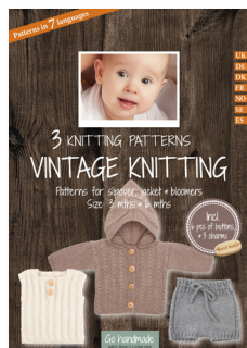
SLIPOVER, JACKET & BLOOMERS - VINTAGE 20031