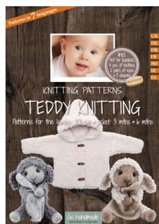
JACKET, SILLE & MULLE - TEDDY 20033