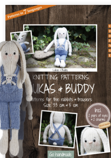
LUKAS & BUDDY 20017