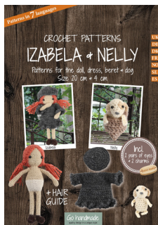
IZABELA & NELLY 20010