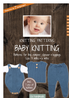
ROMPER, SLIPOVER & LEGGINGS - TENCEL/BAMBOO 20050