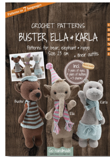
BUSTER, ELLA & KARLA 20028