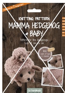
MAMMA HEDGEHOG & BABY 20048 Autumn 2017