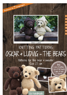
OSKAR & LUDVIG THE BEARS 20018

"Your patterns will be worth every penny xxxx