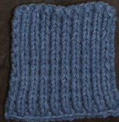
Cosy: Jeans Blue SBF: Jeans Blue