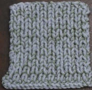
Cosy: Sky Blue SBF: Soft Green