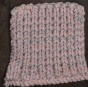
Cosy: Pastel Rose SBF: Light Grey