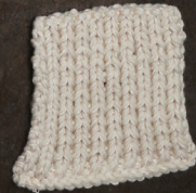
Cosy: Off White SBF: Off White