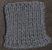
Cosy: Grey SBF: Grey