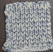
Cosy: Off White SBF: Jeans Blue