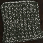
Cosy: Hunting Green SBF: Off White