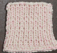
Cosy: Off White SBF: Light Pink