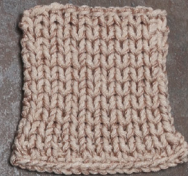
Cosy: Pastel Brown SBF: Nude Beige